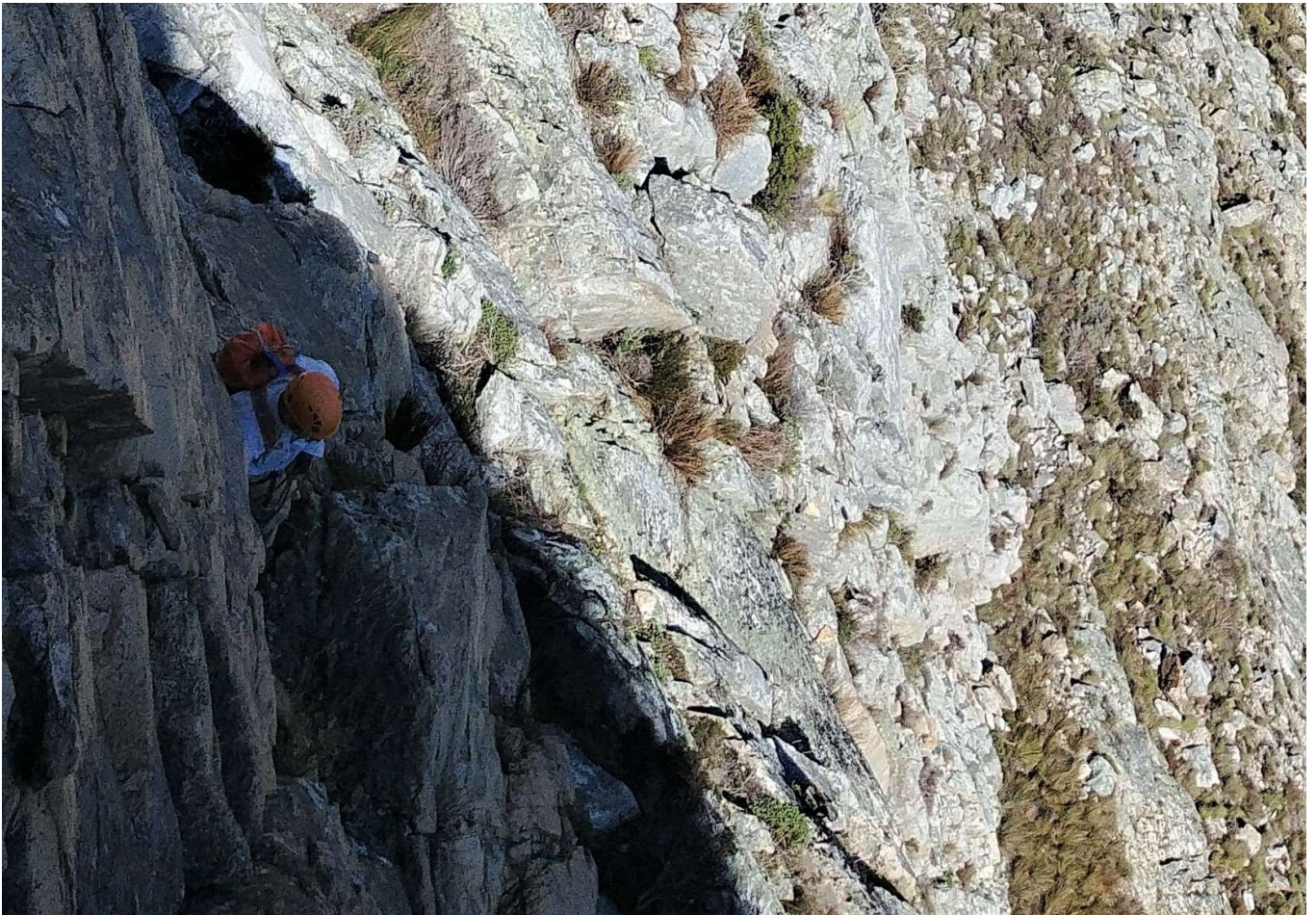
Snort following the steep but easy pitch 4 on Terrific Time.